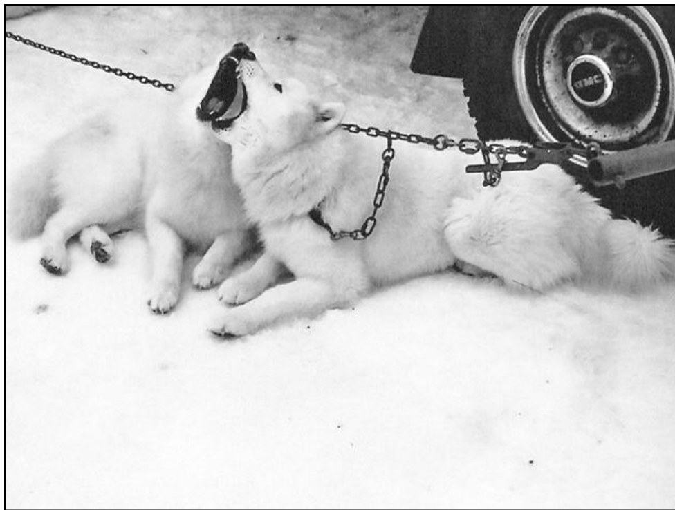
Brothers playing with one another while waiting for their turn to run at Priest Lake