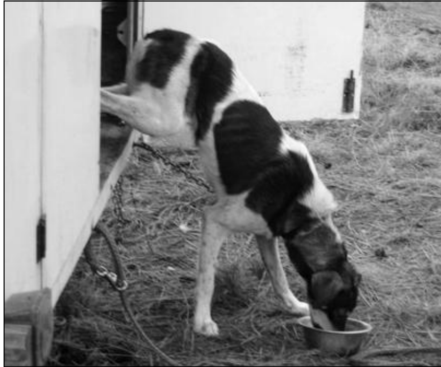
One way to drink while on a drop chain.....